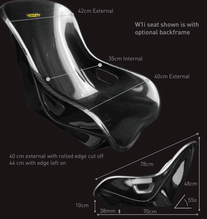
The 38 mm dimension refers to the bottom of the seat dome to mounting plane. Not visible in this picture.

Seat specifications available W2 Black GRP W2 Carbon KEVLAR® epoxy